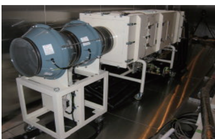
Fig. 3 Wind tunnel for evaporator test

In the figures, horizontal axis Q_b and vertical axis T_{s/} indicate respectively heat flow and saturation temperature of CO 2 at the tube exit. Higher value of T_{s/} means more efficient tube for CO 2 . The result shows that a tube with the triangle fin (No.1) in low Q_b and a tube with slim high fin (No.10) in high Q_b are excellent.