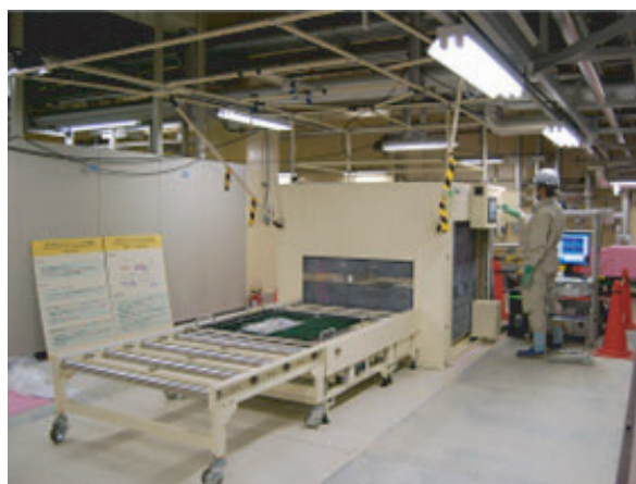
Fig.2 Verification test at Kashiwazaki-Kariwa Nuclear Power Station of Tokyo Electric Power Company