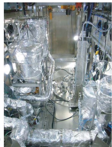
Fig.5 Photos and plain view of engineering-scale electrorefiner with liquid Cd transport to the distillator.