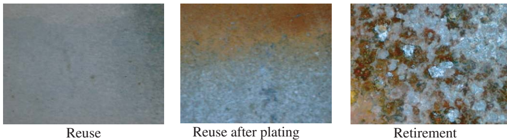
Fig.2 Examples of rust pictures on crossarm